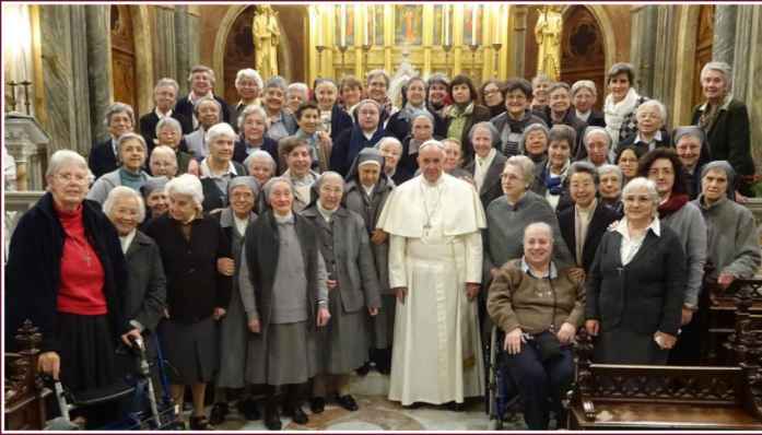
Handmaids gather with Pope Francis at the shrine of St. Raphaela Mary.

When Pope Francis recently visited the Handmaids of the Sacred Heart of Jesus at their residence in Rome, XX Settembre, he left an impression that the sisters will not soon forget. Expressing that his primary reason for making the visit was his desire to pray at the shrine of Saint Raphaela Mary gave them great joy. They described his presence as deeply spiritual. They were grateful for his willingness to answer their many questions with his characteristic simplicity and were heartened by his desire to greet each of the sisters who are confined to the residential infirmary. Most especially, the Handmaids were touched by learning about the faithful affection Pope Francis has for St. Raphaela Mary. He explained that his great devotion to the saint began years earlier, and admitted that her experiences were often a source of guidance through many stages of his life, especially in difficult times.