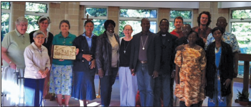
The Handmaid community in Haverford also hosted a group of eight members of the Burkina Faso (West Africa) delegation who traveled to the US to participate in the World Meeting of Families.