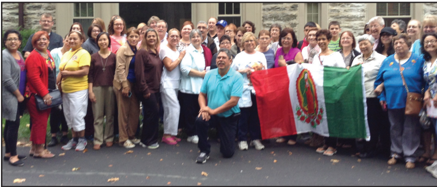
Members of the parish community from St. Francis Xavier Church in Lake Station, Indiana, were guests at St. Raphaela Center for the duration of their pilgrimage to the World Meeting of Families.