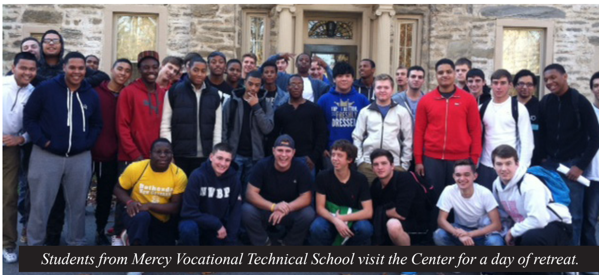
Students from Mercy Vocational Technical School visit the Center for a day of retreat.