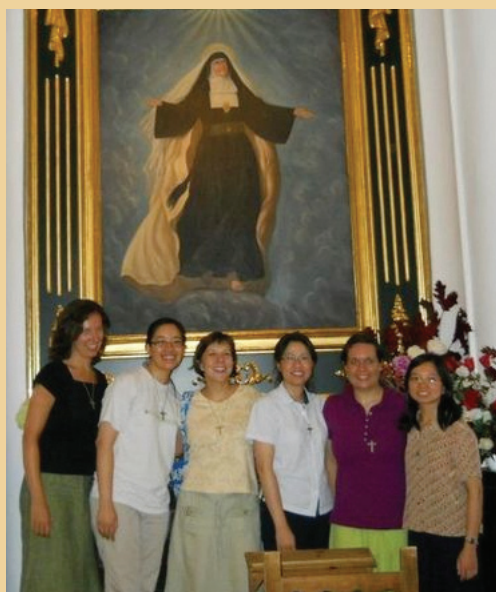
Handmaid formees visit the shrine of St. Raphaela Mary in Spain.