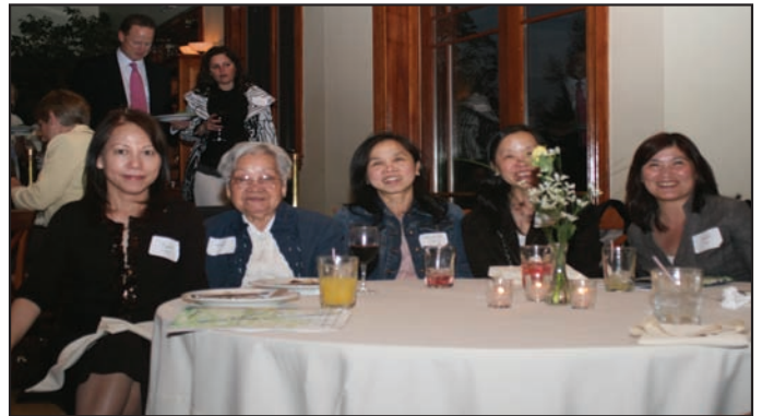
Guests for the Journey of Hope Celebration included friends of the Handmaids from various ministries throughout the USA Province.