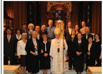
The Handmaid Province Advisory Board members with Cardinal Rigali.

It was a perfect way to extend more of the Handmaid hospitality and combine the influence of one of St. Raphaela's pastimes - making lace.