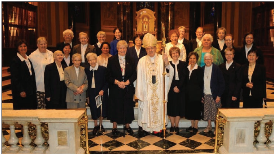
Handmaids from various ministries throughout the USA Province posed with Cardinal Justin Rigali following the Liturgy of Thanksgiving on May 8, 2010. Story on Page 3.

JOY HOSPITALITY SIMPLICITY HUMILITY COMPASSION